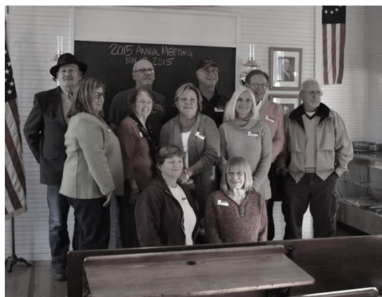
2016 BAHS BOARD