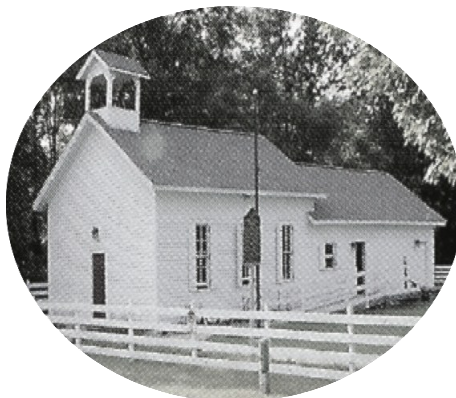
Archiving at Lyon School