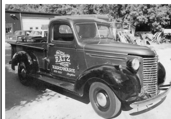
Through June 30 "G. B. Ratz & Son Hardware"

Sunday—Friday 5—8pm Saturday 11am—5pm Closed Monday