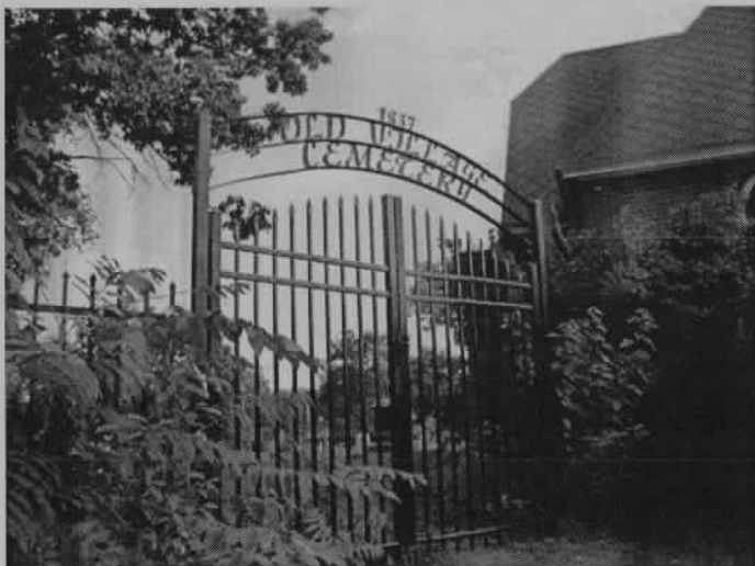
Parade: 10:00 am | Rededication: 11:15 am Cemetery Tours: 12:00 noon

I hope that everyone has set aside time for the rededication of Old Village Cemetery. It will commence immediately after the American Legion and Veterans of Foreign Wars parade and memorial service on Main Street.