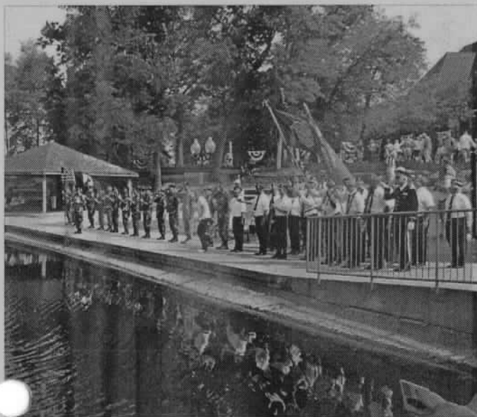
Memorial Day Ceremony at Millpond in front of the Brighton Old Village Cemetery

Memorial Day 2010 marks the renewal of the public's ability to enter and visit Brighton's historic 1837 Old Village Cemetery. The new walkway allows family, friends and community members easy access into the cemetery through the new entrance gate that will be unlocked every day.