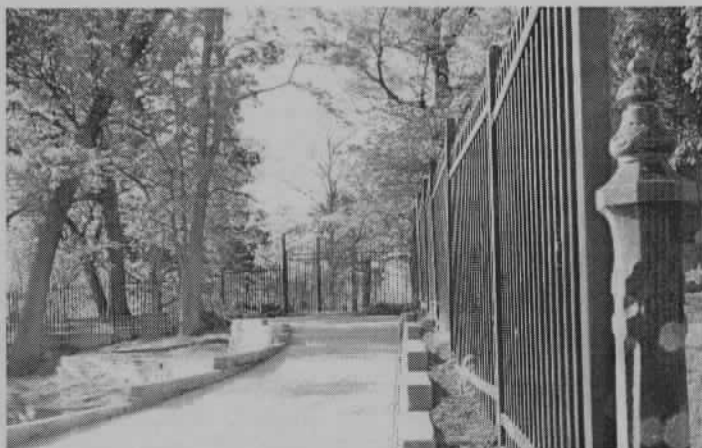
View of the new walkway and gate to the Old Village Cemetery next to the Mill Pond Pavilion in Downtown Brighton

The following events will take place in Downtown Brighton over the Memorial Day weekend. All events are open to the public and free of charge.