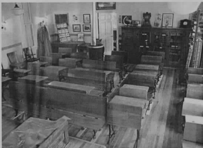
The Lyon School is fully restored and ready for 2nd—4th grade field trips.

Welcome back to the classroom after your nonstop summer of planning new lessons and updating your education credentials. You may not be aware that a 19th century one-room schoolhouse awaits your visit. This is a great opportunity to provide a unique educational setting to enrich your students' knowledge of how families lived and worked in our communities.