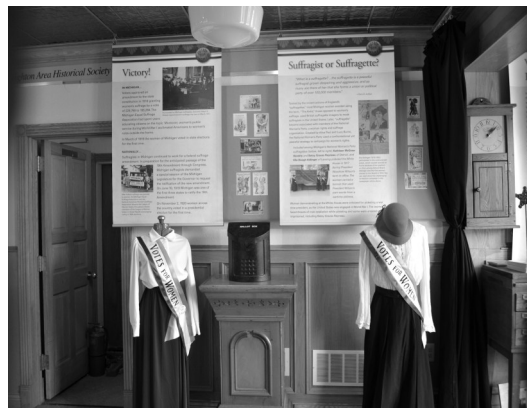
WOMENS SUFFRAGE 100 YEAR EXHIBIT

The City of Brighton Arts, Culture and History (CoBACH) Center is the perfect location for the Brighton community to learn about the history and culture of Brighton. The CoBACH Center aka Old Town Hall is the building built in 1879 by the community for the community.