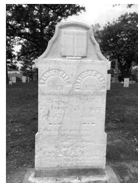
OVC RESTORATION PROJECT