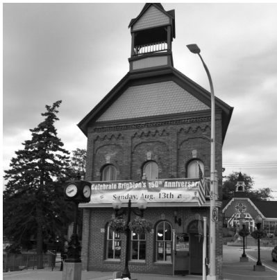
CITY OF BRIGHTON ARTS, CULTURE AND HISTORY CENTER