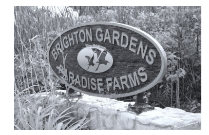
CoBACH In September: Centennial of Brighton Gardens Subdivision

Did you know that Brighton has had an African American community off Old 23 north of Spencer Road since 1920? Check out the early photos that show the cottages that came first and learn the early history of these families desiring a quiet remote location on a lake.