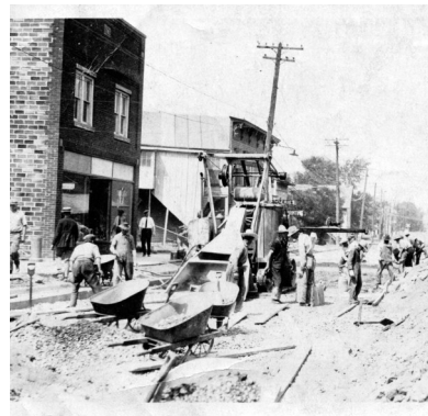
Rolison’s Hardware is to the left.

The Brighton State Bank was awarded the handling of $70,000 in bonds redeemable at the Bank on maturity. Ballew Construction Company was awarded the contract to install the storm sewers . Rennie & Dibble would pave Main Street. February 26, 1924, the Council contracted with Detroit Edison for ‘Boulevard’ lighting to be installed. Livingston Mutual Telephone Company was requested to remove poles from Grand