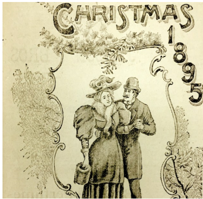
Under the Mistletoe.