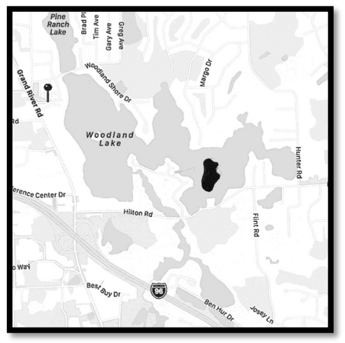
Current Map of Woodland Lake